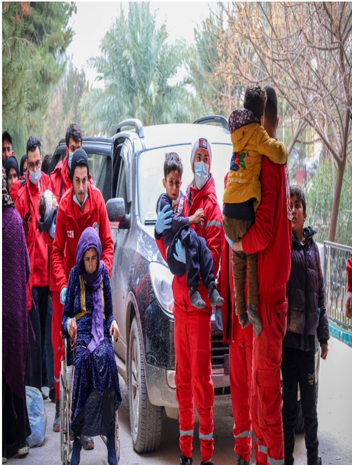
Photo: 1Photo credit: SARC volunteers transporting the injured to the national Hospital, Deir-Zor